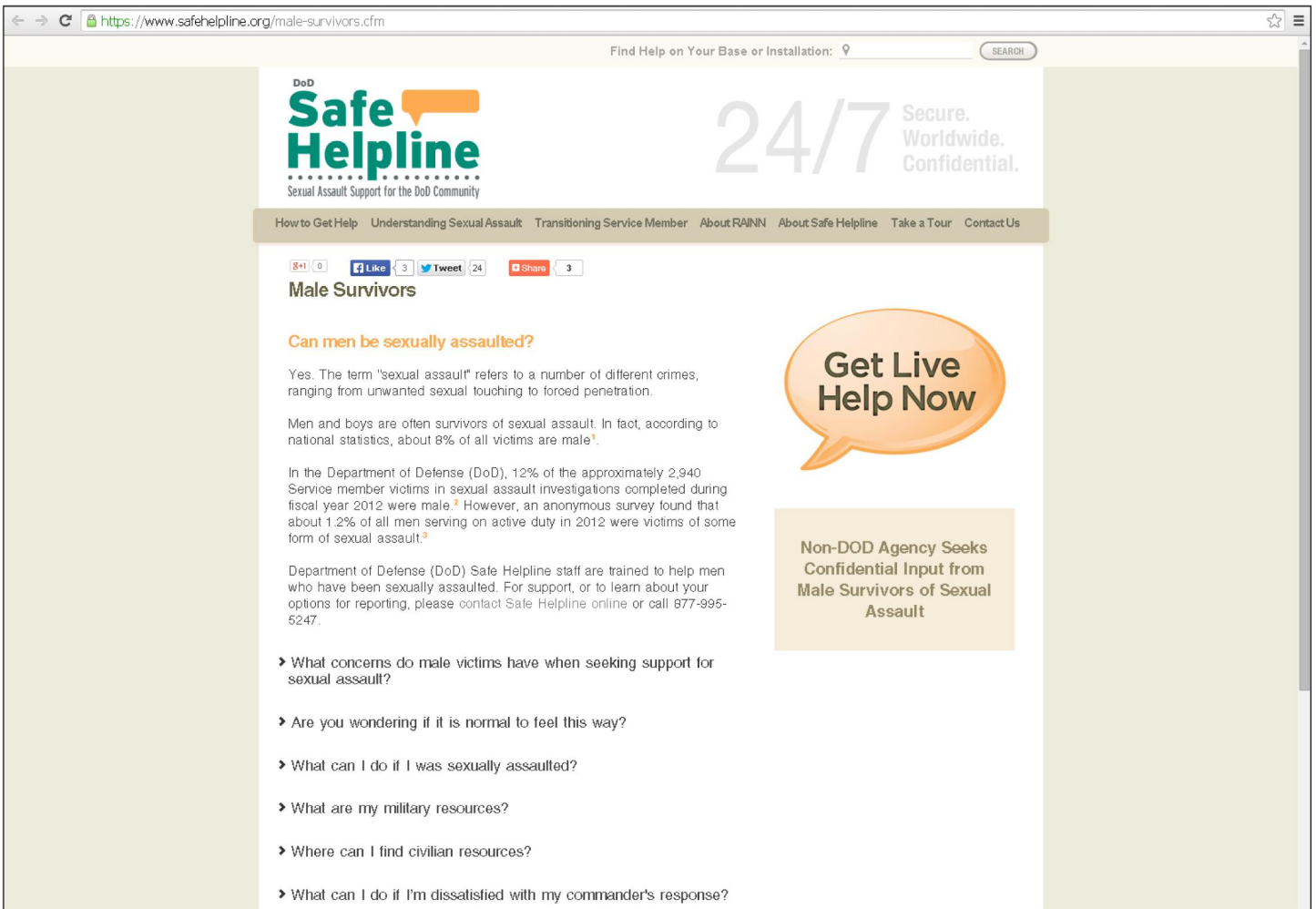
Figure 2: Safe Helpline Male Survivors Page

GAO-15-284