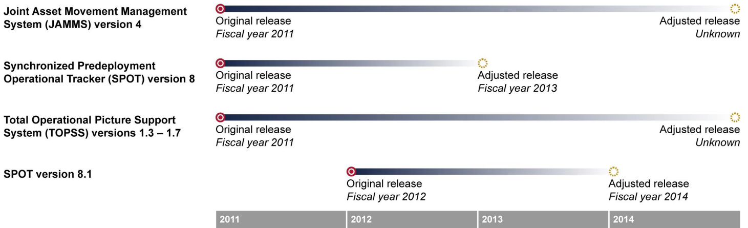
Figure 2: Synchronized Predeployment and Operational Tracker–Enterprise Suite (SPOT-ES) Schedule Delays